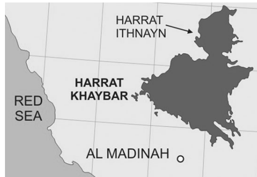
Fig. 1: Location of Harrat Khaybar Lava Field in Saudi Arabia.