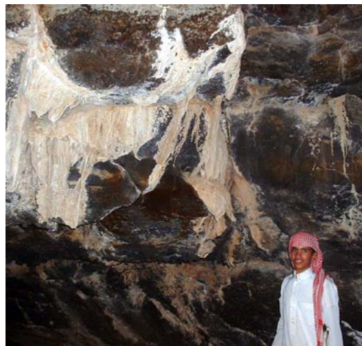
Fig. 2: Calcite Flowstone and Stalactites in Dahl Rumahah.

Dahl Rumahah (also spelled Romahah) is located in the northern part of Harrat Khaybar. A map of the cave is shown in Pint, 2006. The cave is 208 m long and has a horizontal entrance 1 m high by 1.5 m wide, set in a small depression. Most of the cave is a single, nearly flat, northwest-trending passage from 1.5 to 7 m wide and 2.5 m high. In September of 2003, it was found that dry sediment covered the floor of the southeast part of the cave while mud floored the northwest portion and occurred along part of the eastern wall. Water droplets and cave slime cover the ceiling at the far northwestern end of the cave. A natural bridge 1.5 m thick crosses the passage near its western end. Calcite-rich percolation water leaked through ceiling cracks, producing white stalactites, curtains and flowstone (Fig. 2). There is a large area of mixed bones, along with hyena, wolf and fox coprolites plus hedgehog and porcupine quills. A piece of wood shaped like a gouging tool was found among the bones. The partial skeleton (Fig. 3) of an unknown animal is found in the cave, cemented to the floor by calcitic speleothems.