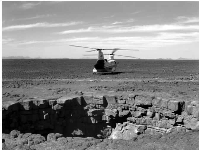
Fig. 7: Collapse entrance to Dahl Umm Quradi in southern Harrat Khaybar.

In February of 2003, an attempt was made to survey Dahl Umm Quradi, a lava tube located in southern Harrat Khaybar. Just outside the cave entrance, a member of the team was seriously injured and had to be rescued by helicopter, resulting in the cancellation of the survey. However, it was noted that the cave has a walk-in entrance measuring 2 x 3 m and a vertical (collapse) entrance 4 m in diameter and ca. 5 m deep (Fig. 7). A local geologist estimates the length of this lava tube at 100-200 m and reports seeing entrances to other caves in the area (Pers. com. by Jamal Shawali, 2003).