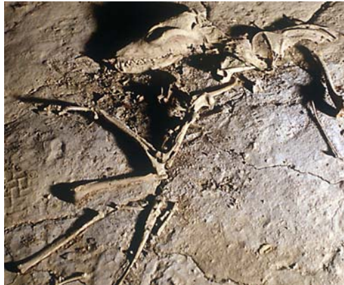
Fig. 3: Skeleton Found Cemented to the Floor of Dahl Rumahah, 105 meters from the entrance.

The highest radon level noted in Saudi caves was found in Rumahah: 119 Pci/l, perhaps due to underlying granite. The cave's temperature was measured at 25° C. Within a period of four hours a change in relative humidity from 68% to 74% was registered at one point in the cave. There is evidence (including construction of a water-retaining wall outside the cave) that this cave has long been used as a water reservoir.