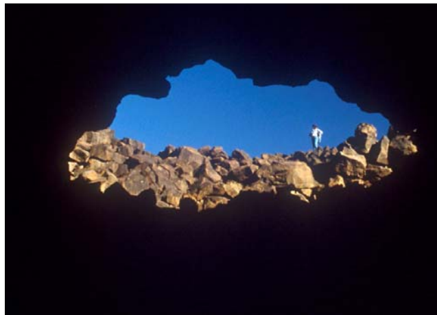
Fig. 4: Entrance to Kahf Al Shuwaymis Lava Tube, seen from inside.

The cave is 530 m long. The entrance (Fig. 4) is a collapse hole 15 m in diameter overlooking the floor of a horizontal passage 5 m below. A steep breakdown slope leads to a mostly south-trending passage varying in width from 4 to 15 m. with a typical height of about 10 m. Lava stalactites under 5 cm in length can be seen. There are at least four caches of animal bones (Fig. 5), presumably carried into the cave by hyenas or other animals. A narrow channel of sand runs almost the entire length of the cave, indicating water flow in the past. A map of Kahf Al Shuwaymis is shown in Pint, 2006.