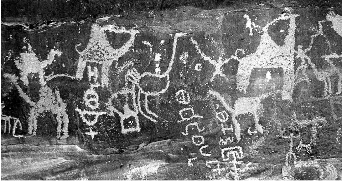
Fig. 10: Ostriches, Camels and Nabatean Script on a Sandstone Cliff Located 22 km north of Dahl Rumahah.