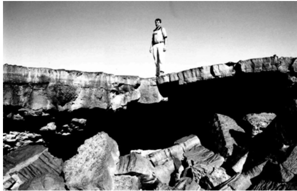
Fig. 8: Entrance to an unnamed volcanic cave in the Jebel Qidr flow.