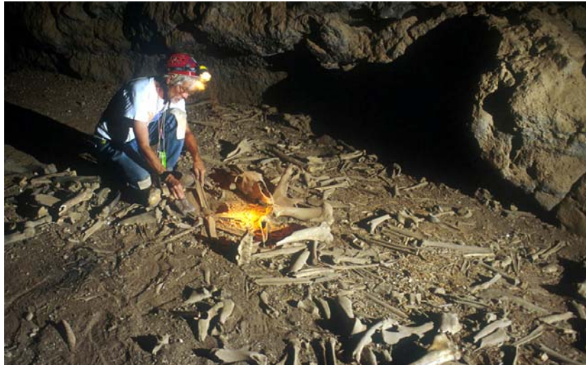
Fig. 5: An area covered with mixed bones, found over 250 meters inside Kahf Al Shuwaymis.