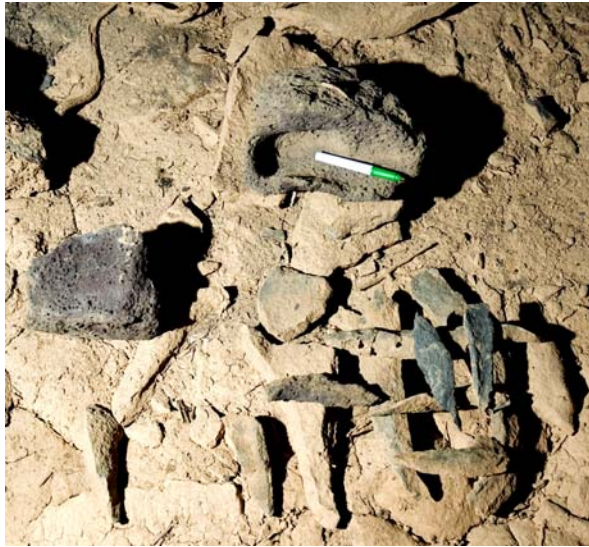
Fig. 6: Items found in the east passage of Umm Jirsan System. Foreground: Pointed or sharp-edged basalt fragments. Background: basalt rock with mortar-like form. The pen is 12 cm long.