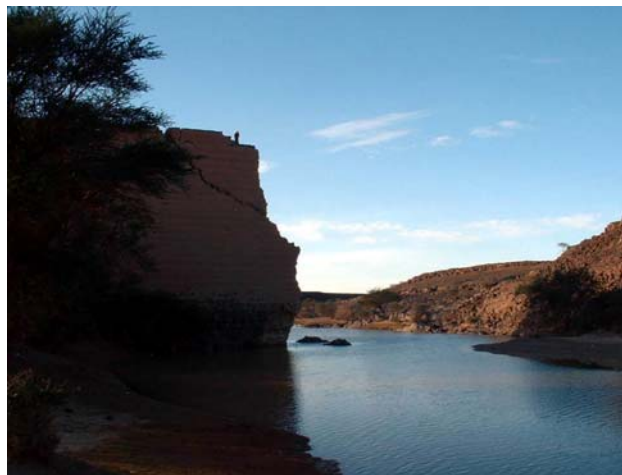
Fig. 9: River and Part of Qasaybah Dam at the Western Edge of Harrat Khaybar.

The National Geographic Society's Genographic Project is based on evidence that modern human beings are descendants of people who left Africa 50,000 to 70,000 years ago. Some of these emigrants appear to have crossed the Bab Al Mandab at the southern end of the Red Sea and then traveled north on the Arabian Peninsula. These people may have discovered that rain water can drain from lava fields at their edges. This is the case at the western edge of Harrat Khaybar, where a large old step dam was constructed by people living in a nearby ancient settlement. Ruins of this dam, Sadd Qasr al-Bint or Qasaybah, are shown in Figure 9. The settlement, known as Khaybar, is said to have been conquered by the Neo-Babylonian king Nabonidus in 552 BC (Barbor, 1996).