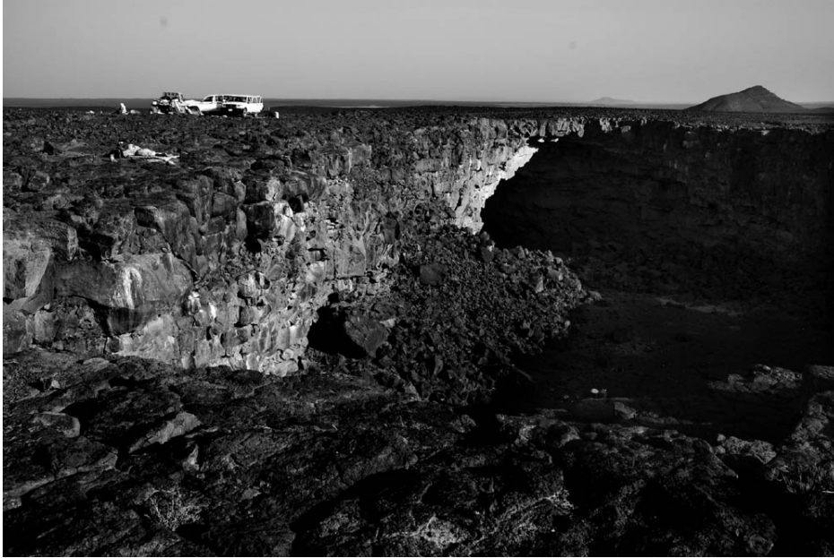
Fig. 2: Collapse 1, with a view of the entrance to the west passage.

A map of the Umm Jirsan System is shown in Figure 8. The main passages of the system extend east and west of Collapse 1, which measures 89 m long by 55 m wide with a depth of 13 m and which is shown in Figure 2. A breakdown slope on the south side of this collapse supports a narrow path from the surface to the floor. In many places along this path, the basalt has been polished, perhaps by the feet of human or animal visitors.