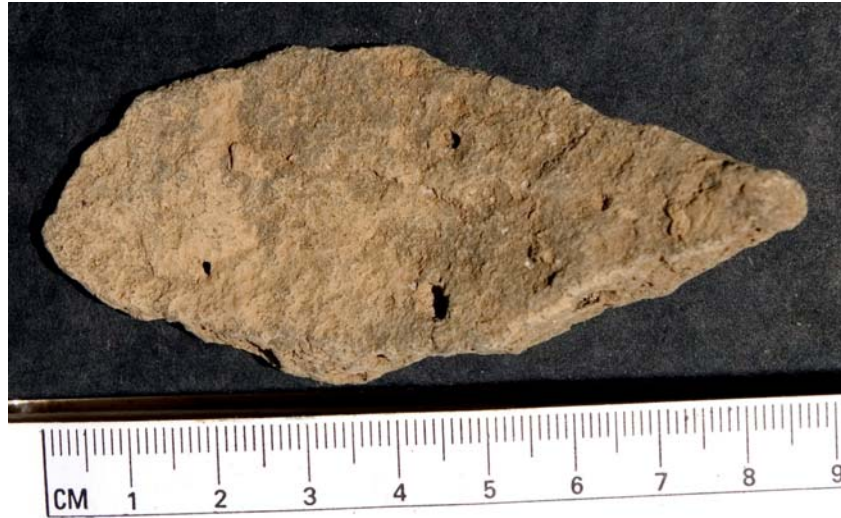
Fig. 7: One of many pointed or sharp-edged basalt fragments found near station 5.