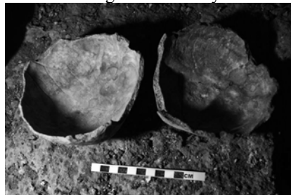
Fig. 5: Fragments of two human skull caps found in the Wolf Den in the west passage.

Bones, presumably carried in by predators, were found throughout the cave but were particularly concentrated at the extreme western end of the system in the same place (the Wolf Den) where growls were heard. From among many bones lying on the surface, a human skull, two human skull-cap fragments (Fig. 5), one particularly large animal bone and one springy, curved stick were collected, removed from the cave and radio-carbon-dated. The results are shown in Table 1. One of the human skull fragments was dated at 4040±30 years BP and the still unidentified animal bone (Fig. 6) was found to be 2285±30 years old. Since these items were found lying on the surface of the sediment layer covering the original floor, it is speculated that still older human and animal remains might be found by excavations carried out by competent investigators.