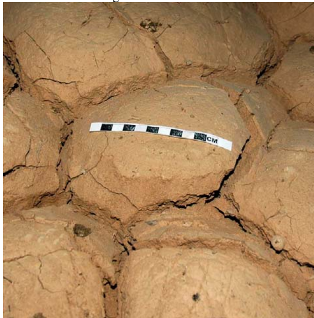
Fig. 3: Mounds on the floor of the east passage.

The entrance to the east passage (shown in the enlarged segment of Fig. 8) measures 10 m high and 35 m wide. A shallow water channel can be seen along the north wall of the entrance room and mounds of rock-dove guano along the opposite side. Sediment covers the original floor of the cave. This was found to be 1.17 m deep at station 3, with the measurement taken in the center of the passage. North of station 4, much of the surface of the passage floor takes the form of mounds roughly 15-30 cm in diameter and varying in height. XRD analysis showed one of them to be composed principally of quartz, albite and kaolinite as well as nontronite, biotite, microcline and augite with traces of saponite, montmorillonite and hematite. A number of these mounds are shown in Figure 3.