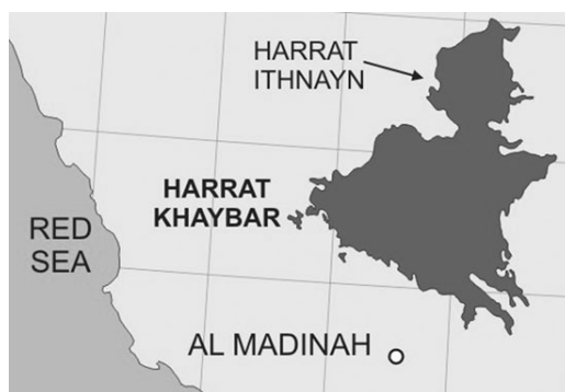
Fig. 1: Location of Harrat Khaybar Lava Field in Saudi Arabia

Al-Malabeh et al. (2006) reported that Al-Fahda Cave in Jordan had been surveyed with a total passage length of 923.5 meters. This was, at the time, the longest known surveyed cave on the Arabian Peninsula. In 2007, Umm Jirsan Lava-Tube System in Saudi Arabia was found to be 1481.2 meters long with features of possible archeological significance. Mapping and limited studies of Umm Jirsan System were carried out by members of the Saudi Geological Survey and the author during five days.