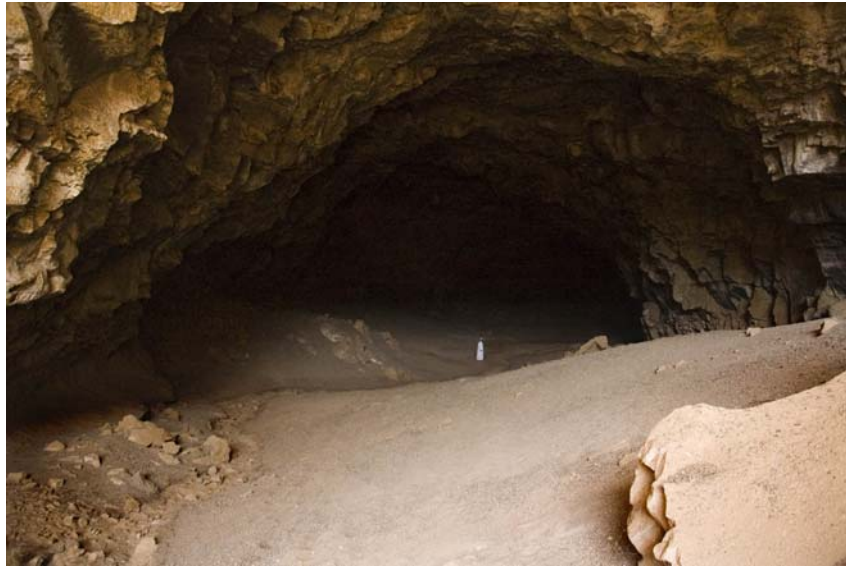
Fig. 4: A human figure provides scale in the entrance to the west passage.

The west passage has only one entrance (shown in Figure 4) and measures 341 m in length with a maximum passage width of 45 m and maximum height of 12 m. Lava levees are prominent in this section of the system and the sediment mounds are notably lacking. Moist spots are found in both of the cave's long passages, with evidence of water flow particularly noticeable in the east passage. A third passage, 34 m long with a maximum of 20 m wide and 4 m high connects Collapse 2 to Collapse 3.