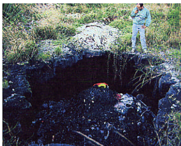
Fig. 3 – Cremation Ground Cave, Plaine des Roches, is almost filled with industrial waste.

As occurs elsewhere, the breaking of speleothems is not an uncommon event. This may be accidental but from the fact that the broken pieces are rarely seen, one can assume that “souveniring” is fairly common. Burning of old tyres has had a major impact on some caves, particularly Caverne Trois Bras where every surface in the larger part of the cave is covered in carbon. It is hard to see this activity as other than vandalism, though in some places it seems to occur in conjunction with black magic.