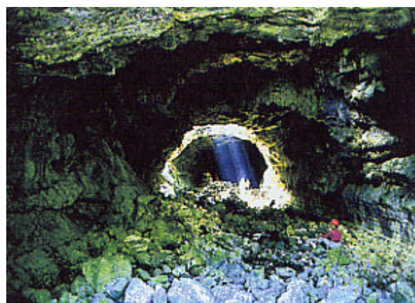
Fig. 5 – Twilight Cavern would be the major focus of a Plaine des Roches Lava Caves National Park.