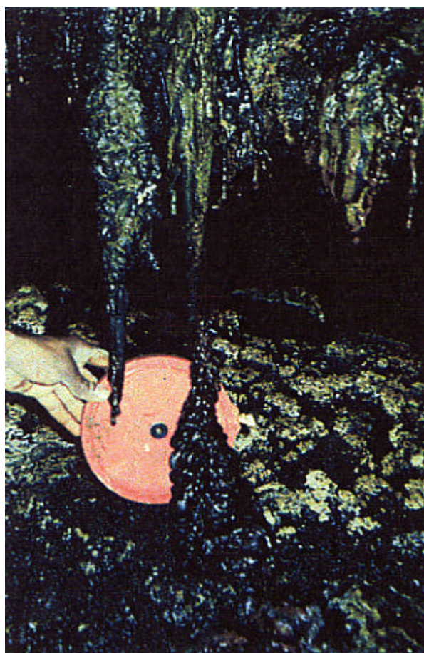
Fig. 2 – Lava caves contain unusual geological and mineral deposits worthy of protection.

Very many of the caves have high scenic and recreational values and, in the case of Pont Bondieu, stairways have been installed to facilitate tourist and local community access. Unfortunately this has not been accompanied by information or interpretation so it has done little to raise public appreciation of caves. Promoting the recreational and scenic values of the caves in the absence of a responsible management authority and enforceable statutory protection would pose significant risk of irreparable damage to the caves and threats to public safety.