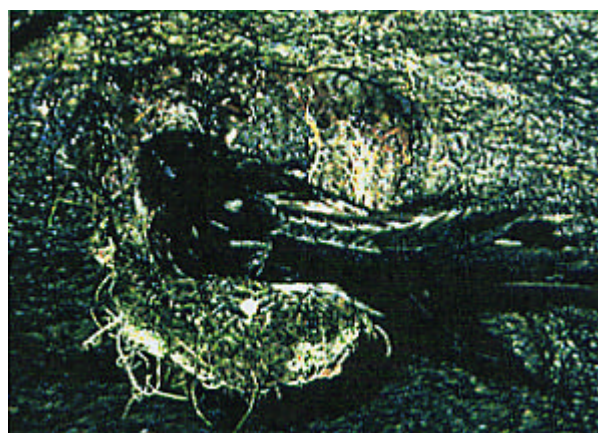
Fig. 1 – The Mascarene cave swiftlet is the most obvious of Mauritian cave fauna. For its value to agriculture alone it deserves to have its main breeding caves protected.

The caves were shown to possess a range of values, most particularly as essential nesting and roost sites for the Mascarene cave swiftlet, Collacalia francica , (see Fig. 1) and the free-tailed bat, Tadarida acetabulosus . No less than