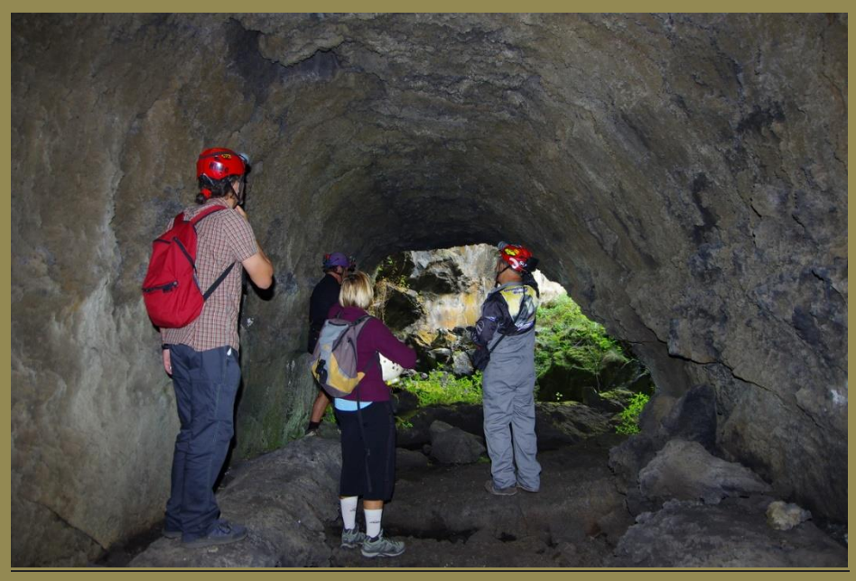
Figure 5: Intralio Cave, the biggest lava tube