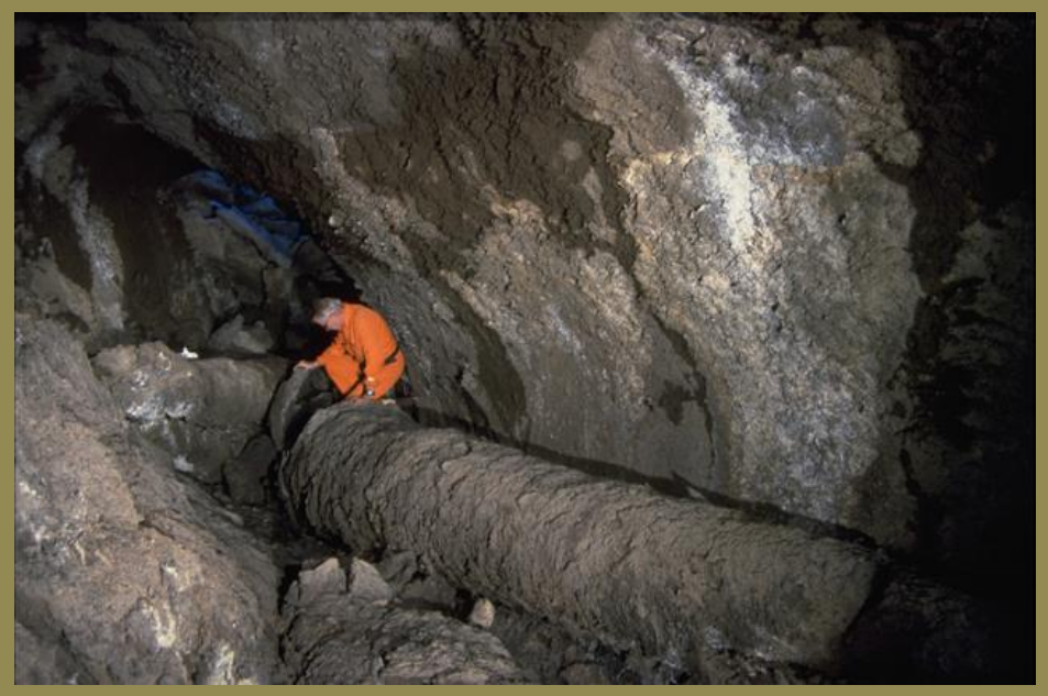
Figure 10: Catanese II, a lava roll - ph. G. I. Sanfilippo F) CATANIA'S NATURAL AND CULTURAL HERITAGE

Catania was founded in the 8th century BC by Chalcidians, a Greek population coming from Thrace. In 1434, the first university in Sicily was founded in the city. In the 14th century and into the Renaissance period, Catania was one of Italy's most important cultural, artistic and political centres.