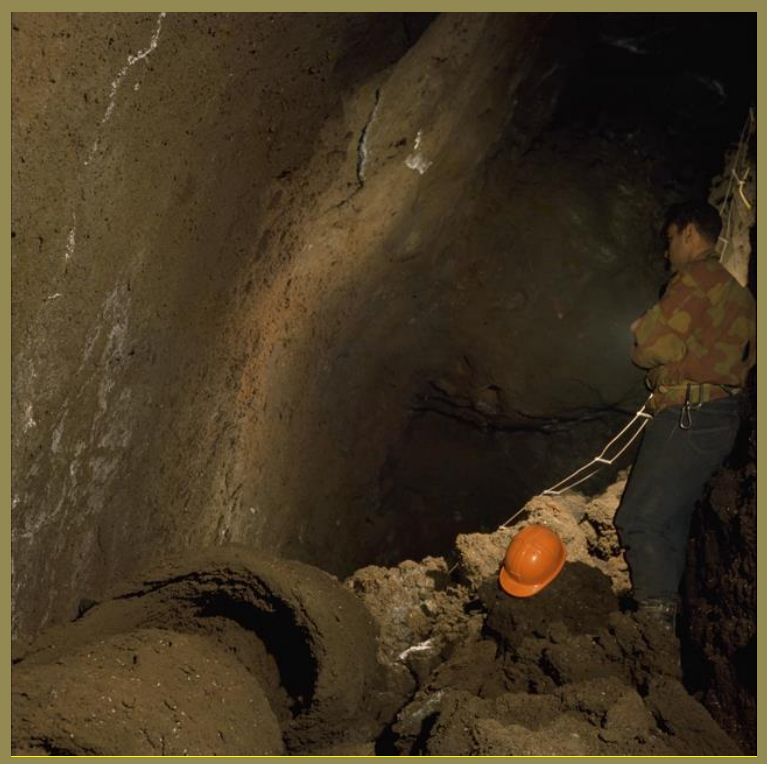
Figure 4: Palombe Cave, a lava roll

To reach the front of the collapsed material requires climbing a jump of 6 m on unstable blocks. From the room, a steep slope of loose material can be followed for 25 m. Subsequently, it is still possible to follow the fracture for 75 m, which is again intact and gradually shrinking until it becomes blocked. The floor here is made up of lava with a fragmented scoriaceous surface. In the terminal part of the cave the eruptive fracture is on two different levels. In the lower one there are at some points accumulations of fine volcanic sand; it is also possible to observe curled sheets of lava with the formation of rolls. In many places, slabs have detached from the walls and clutter the passage.