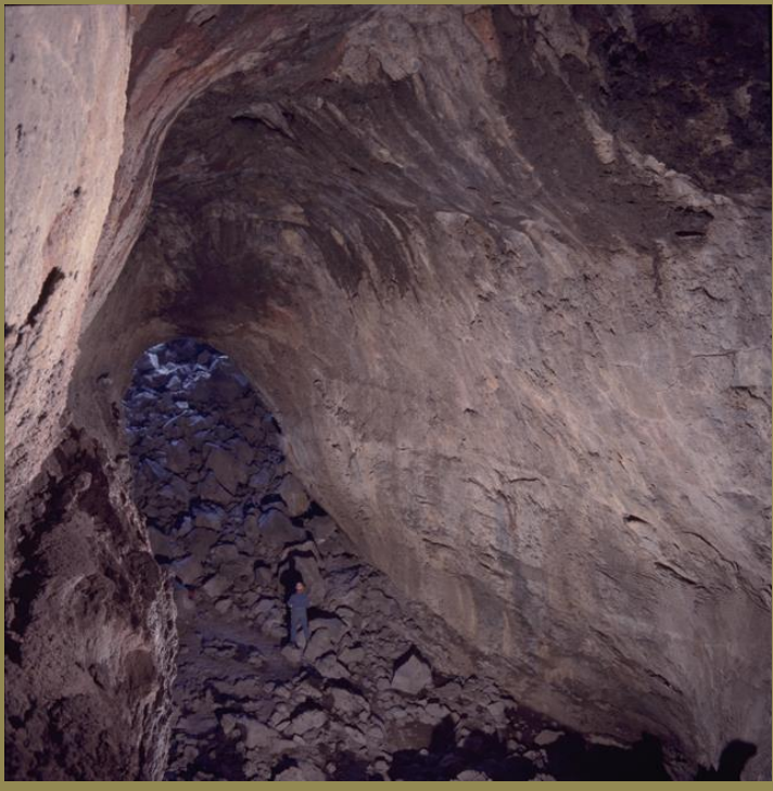
Figure 10: Catanese I

The second cave consists of a single tunnel just over 20 m long. You enter by descending on a chaotic mass of collapsed blocks. The floor, after the first section, appears flat with beaten earth and stones; towards the bottom it is possible to observe lava with a joint surface. On the walls there are numerous sheets of lava of different thickness and folded in various ways. The section of the cave has a characteristic pointed arch shape, but not symmetrical as is normally observed in other cavities. The southwest wall is overhanging while the northeast is an inclined plane on which it is easy to climb.