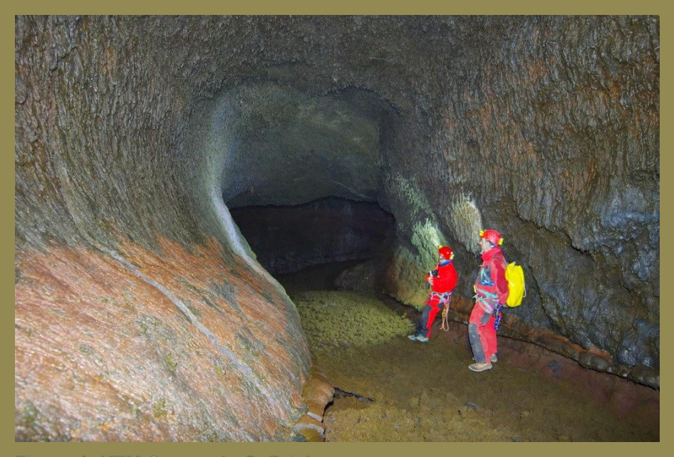
Figure 1: KTM Cave c) GROTTA DELLE PALOMBE

A pit 8 m deep gives access to a first room of the size of 5 m by 15. At the bottom of this room there is a 3 m deep well that leads to a 15 m long steep slope that ends in a smaller room than the previous above a 17 m deep well. From the base of this pit you can follow the eruptive fracture for about 60 m southwards. This is well preserved in some sections and has a uniform glazed lining on the walls, formed during the eruption. Elsewhere the walls of the fracture collapsed and the material behind them collapsed inside the cavity in chaotic masses of large blocks or in heaps of small stones. Following these phenomena, the cavity has several enlargements. Continue through a passage located 6 m high, reachable by a ladder that can be fixed to a rocky outcrop. This opening leads to a section of the cavity where the walls are intact and a couple of metres apart. A little further on we note a collapse of the western wall. The consequence of the collapse is the formation of a room at a higher level.