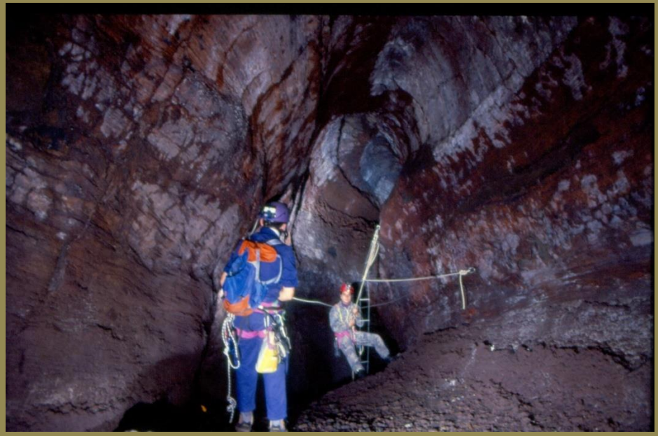
Figure 2: Tre Livelli Cave, from first level to the second