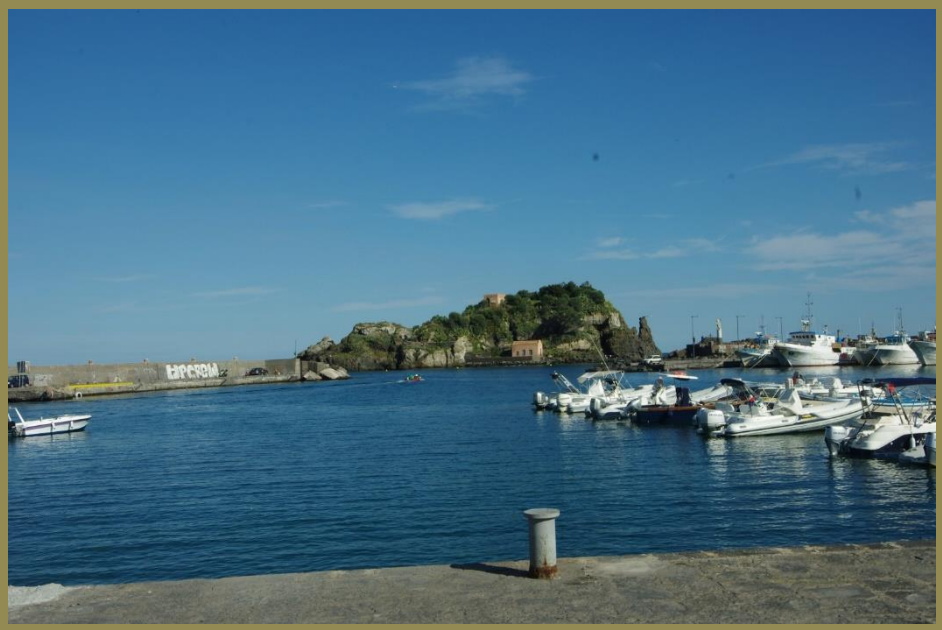
Figure 11: Acitrezza port, in background the Lachea island