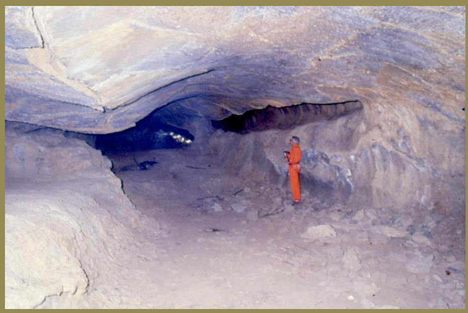
Figure 7: Micio Conti Cave