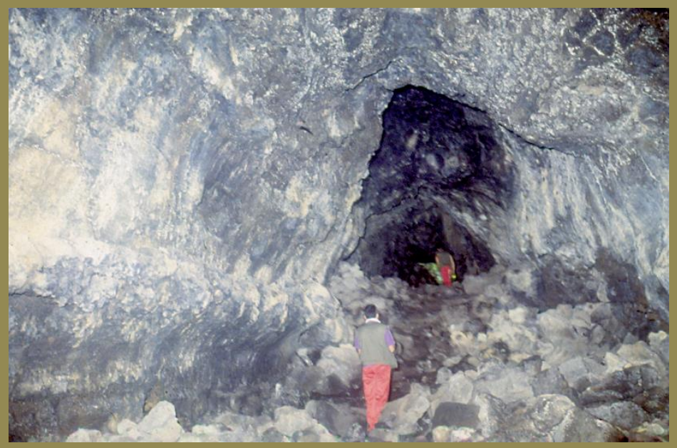
Figure 6: Burrò Cave

part of the cavity a large lamina detached from one of the walls and, leaning against the opposite side, produced some sort of elevated room. About 30 meters further down, a rock pillar separates the tunnel into 2 small parallel tunnels. The cave has a large colony of bats of different species.